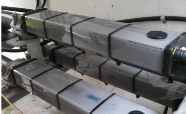
Example of FMC on high voltage cable with IP68 protection cover