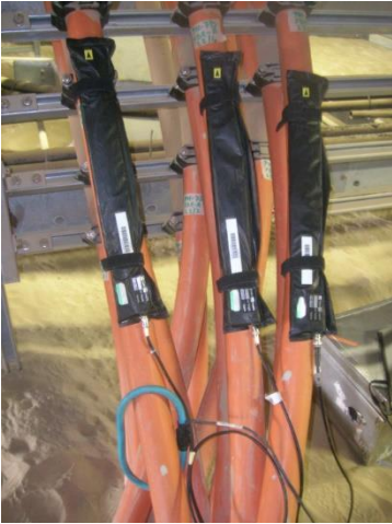
Example of FMC on medium voltage cables